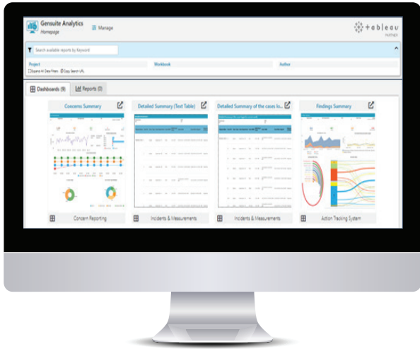
Gain Data Insights with Analytics and Reporting

As part of a broader set of supplier management solutions, these key Benchmark Gensuite solution components have been critical to facilitating the project.